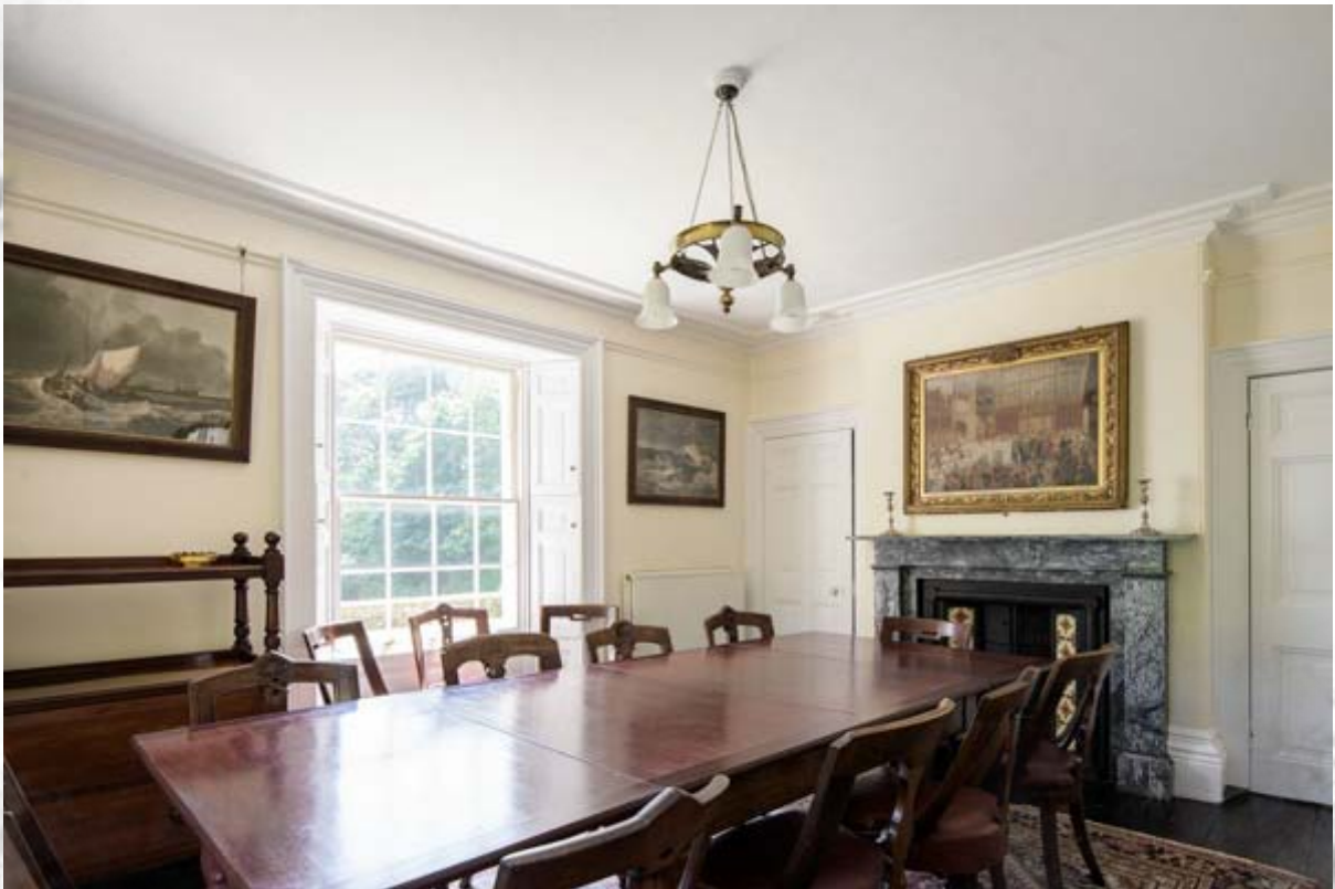
Milcombe House - Dining Room