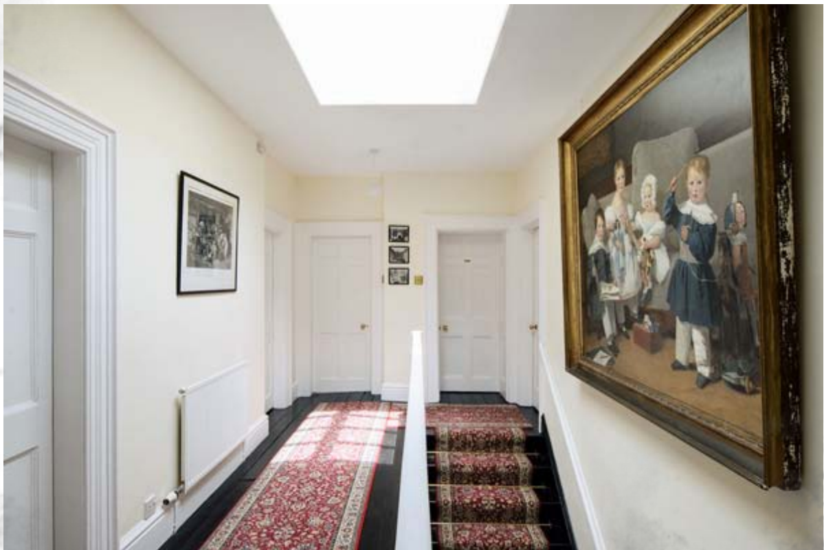
Milcombe House - Landing