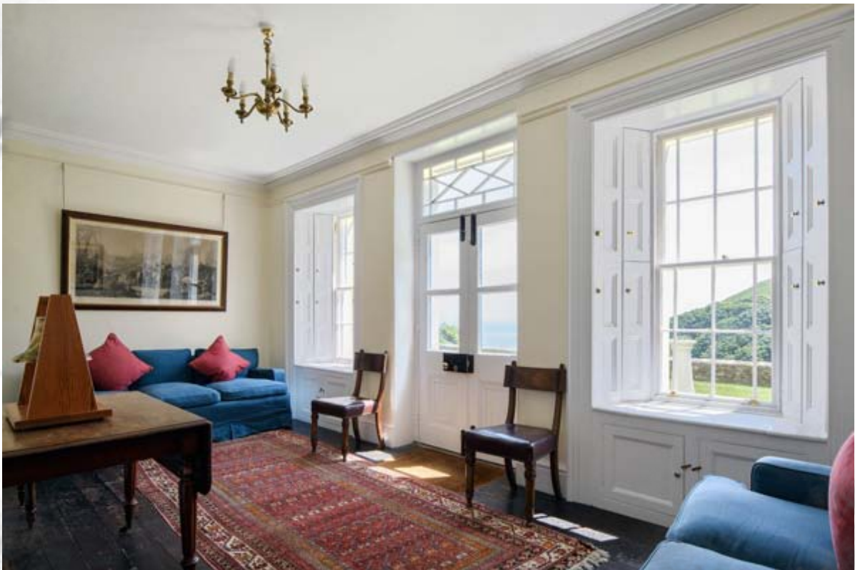
Milcombe House - Central Hall

He considered building his home at Gannet's Combe, some way towards the North End beyond Admiralty Lookout but instead chose Milcombe Valley, considerably closer to what was then and is now the heart of the island and its landing beach. It is a perfectly sheltered position - described by Nikolaus Pevsner as "the only place where Lundy can be seen in so gentle a mood".