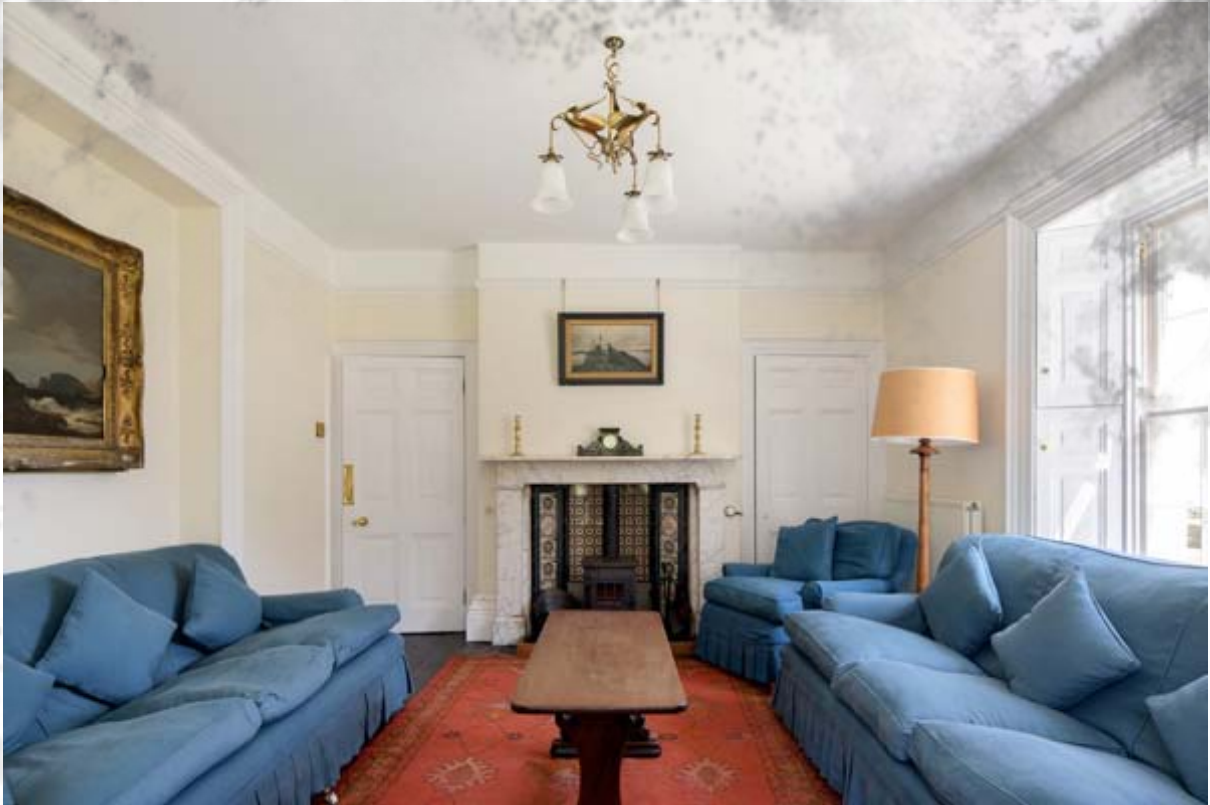
Milcombe House - Sitting Room