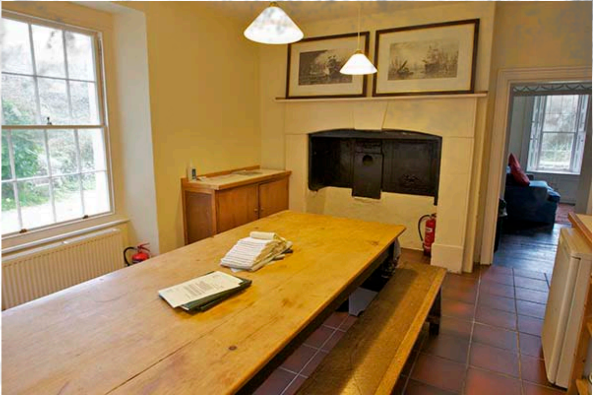
Milcombe House - Kitchen